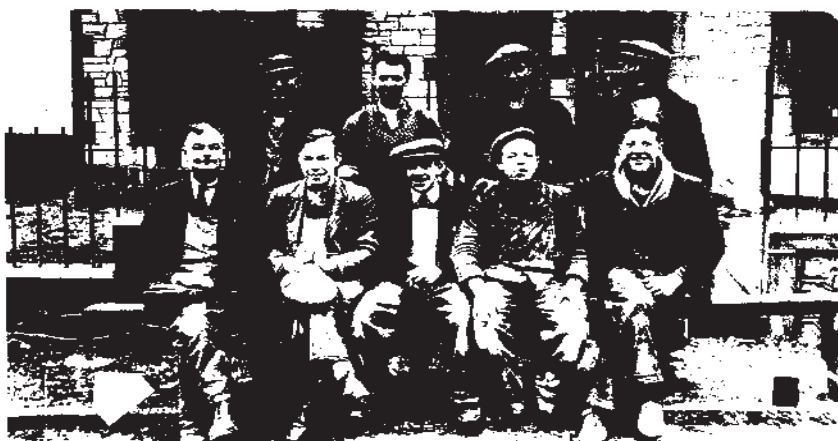
Dad & Grand Hall from left Corstorphine, Edinburgh Scotland around 1938

Please contact me at: archivist@corstorphinetrust.co.uk